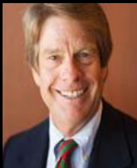
"Consortium Claims-Undervalued Underlitigated"