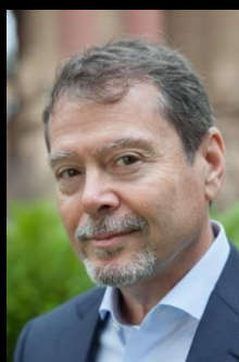
"Digging Deeper to Find That Hidden Coverage"