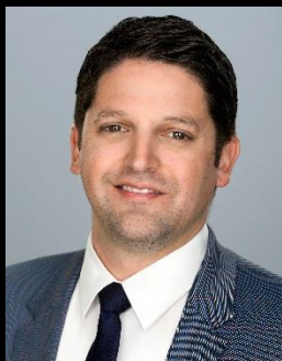
"The Power of Co-Counsel"