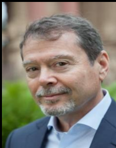
"Digging Deeper to Find That Hidden Coverage"