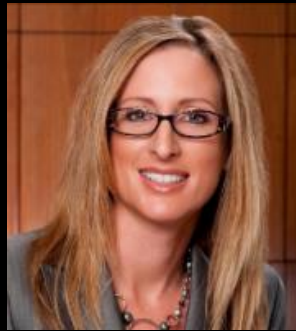
"Unconscious Bias: Working to Improve Diversity"