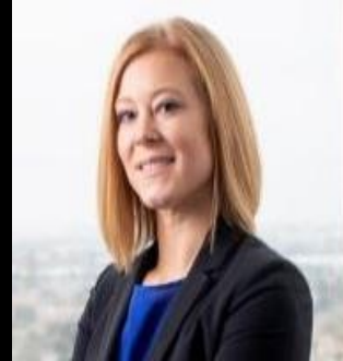
"How to Ethically Advertise Using Social Media"