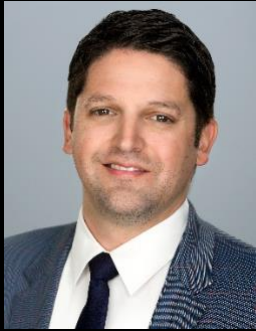
"The Power of Co-Counsel"