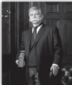
JUSTICE OLIVER WENDELL HOLMES JR.