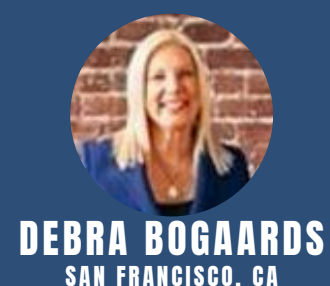
Mediation Panel ""Breaking Impasse" is a bit pase"