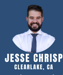
"How to win comparative fault dangerous construction zone cases"