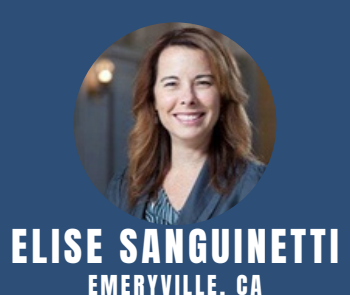
"Live and Remote Jury Selection - Tips and Pitfalls "

"Presenting Plaintiff Injuries in Closing Argument "