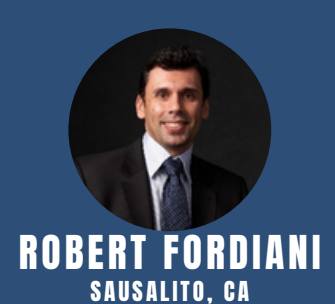
"The ABC's in taking on FEHA Employment Cases"