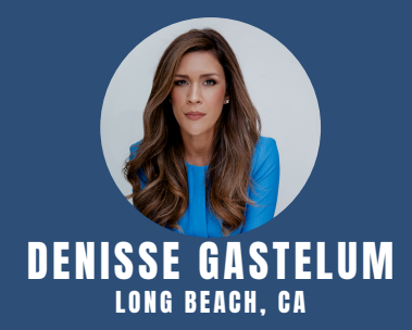
"Public Entity ESI: Navigating the Virtual Gold Mines"